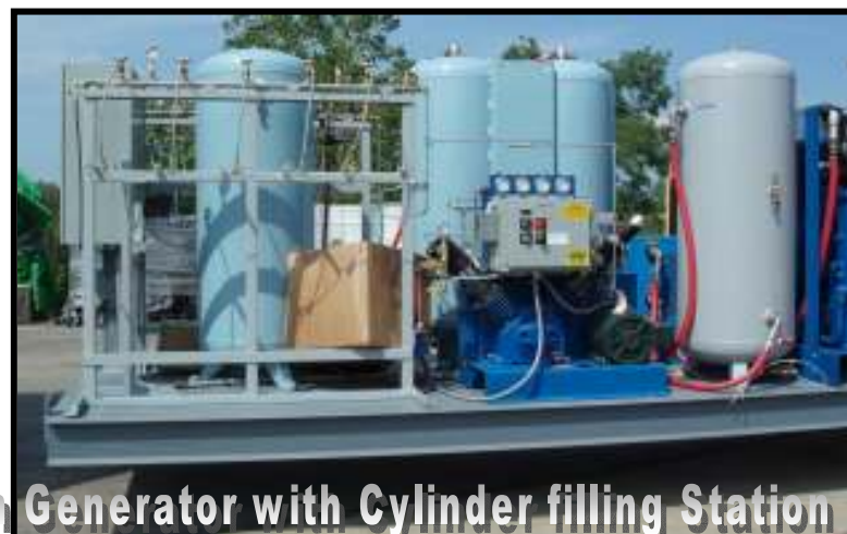
Skid Mounted Oxygen Generator with Cylinder filling Station